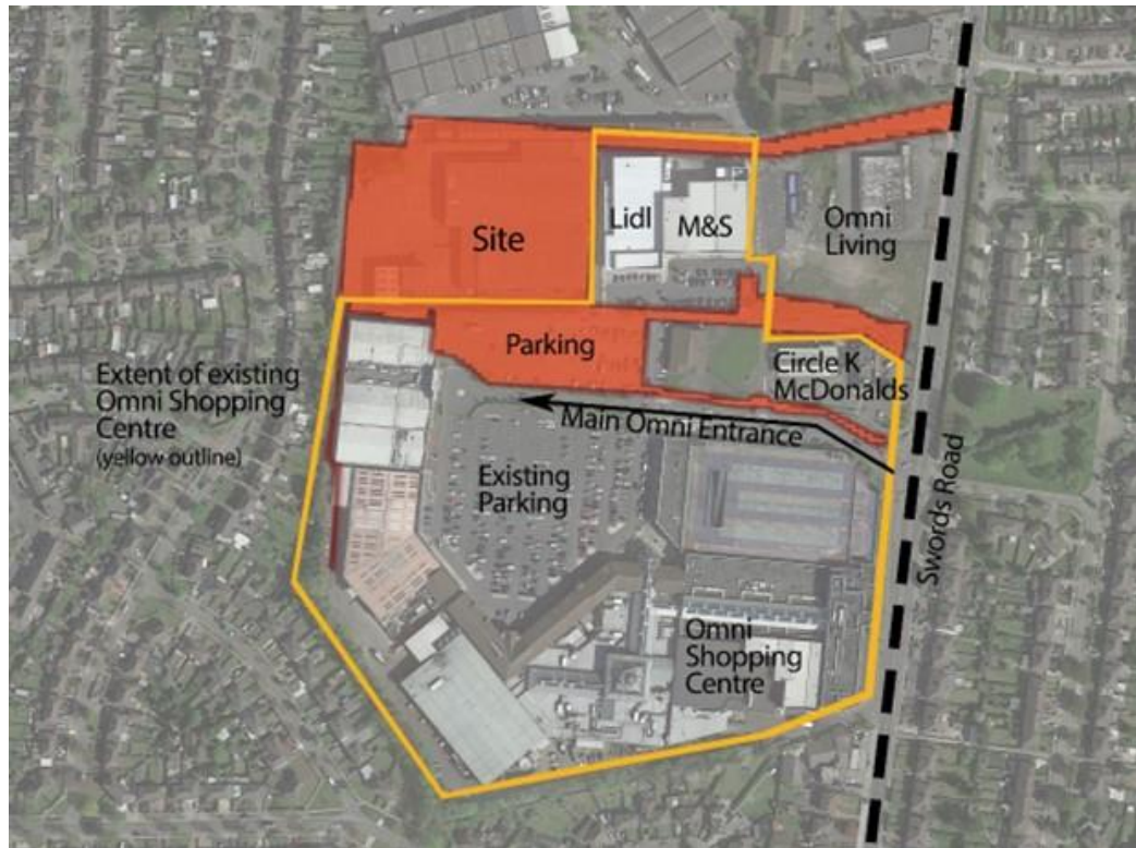
Figure 12.1 - Site (shaded in orange)

primary access is proposed from same. Service access will be from the Swords Road along the access road south of AIB, Swords Road, Santry.