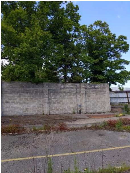
Figure 12.5 North-west boundary -