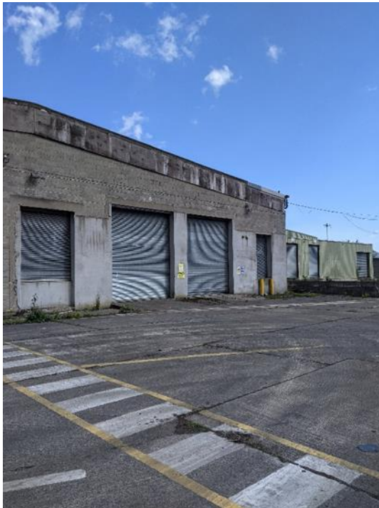
Figure 12.10 Warehouse Structure