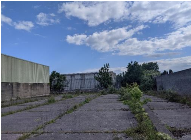
Figure 12.8 View to south