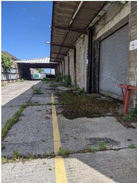
Figure 12.3 - View to east of Northern boundary