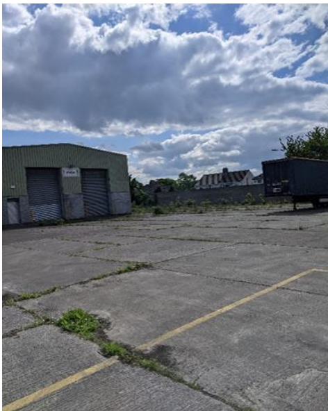
Figure 12.9 View to west