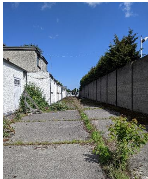
Figure 12.6 Boundary Walls and Warehouse