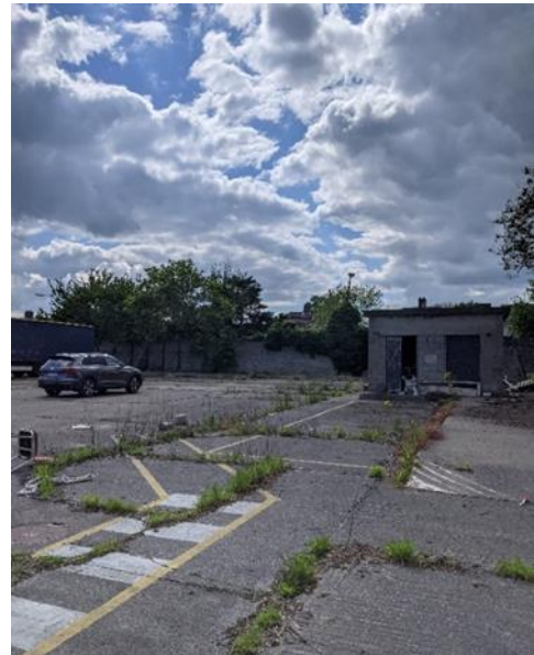
Figure 12.4 - Concrete Hardstanding