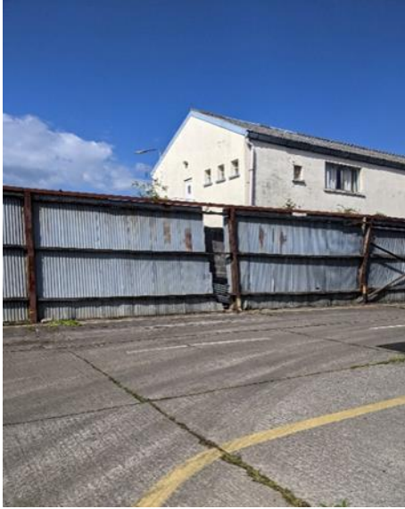
Figure 12.7 Northern Boundary