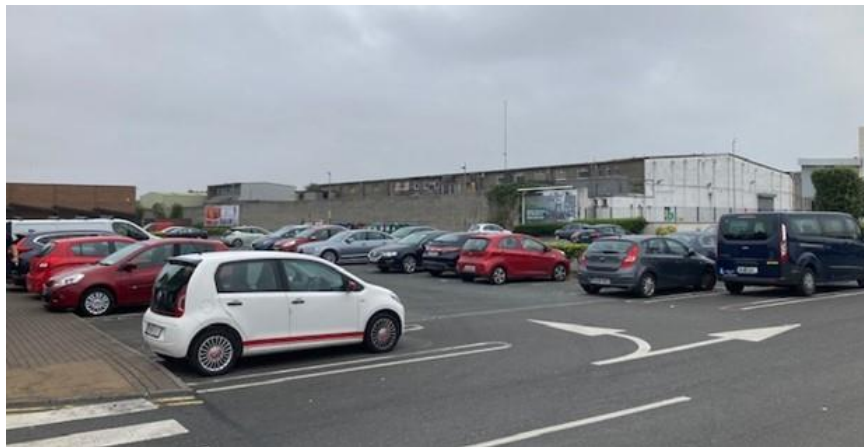
Figure 12.2 - View North West of the site